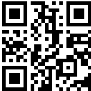
ÖH WU website QR code

Of course, we also provide a lot of information on the ÖH WU website!